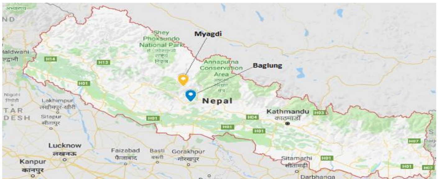
Figure 1: Location of Baglung and Myagdi, Nepal

Nepal is the second poorest country in Asia and the 16 th poorest nation in the world in terms of its per capita income (UK Government, 2018). This research looks at two districts called Myagdi and Baglung (see Figure 1) which are hilly, remote and located in Western Nepal (Carers Worldwide, 2018; Baglung District Coordination Committee Office, n.d.; Myagdi District Coordination Committee Office, n.d.). The villages are mostly inaccessible by road, with distances between villages measured in the number of days to walk (LEADS Nepal, n.d.).